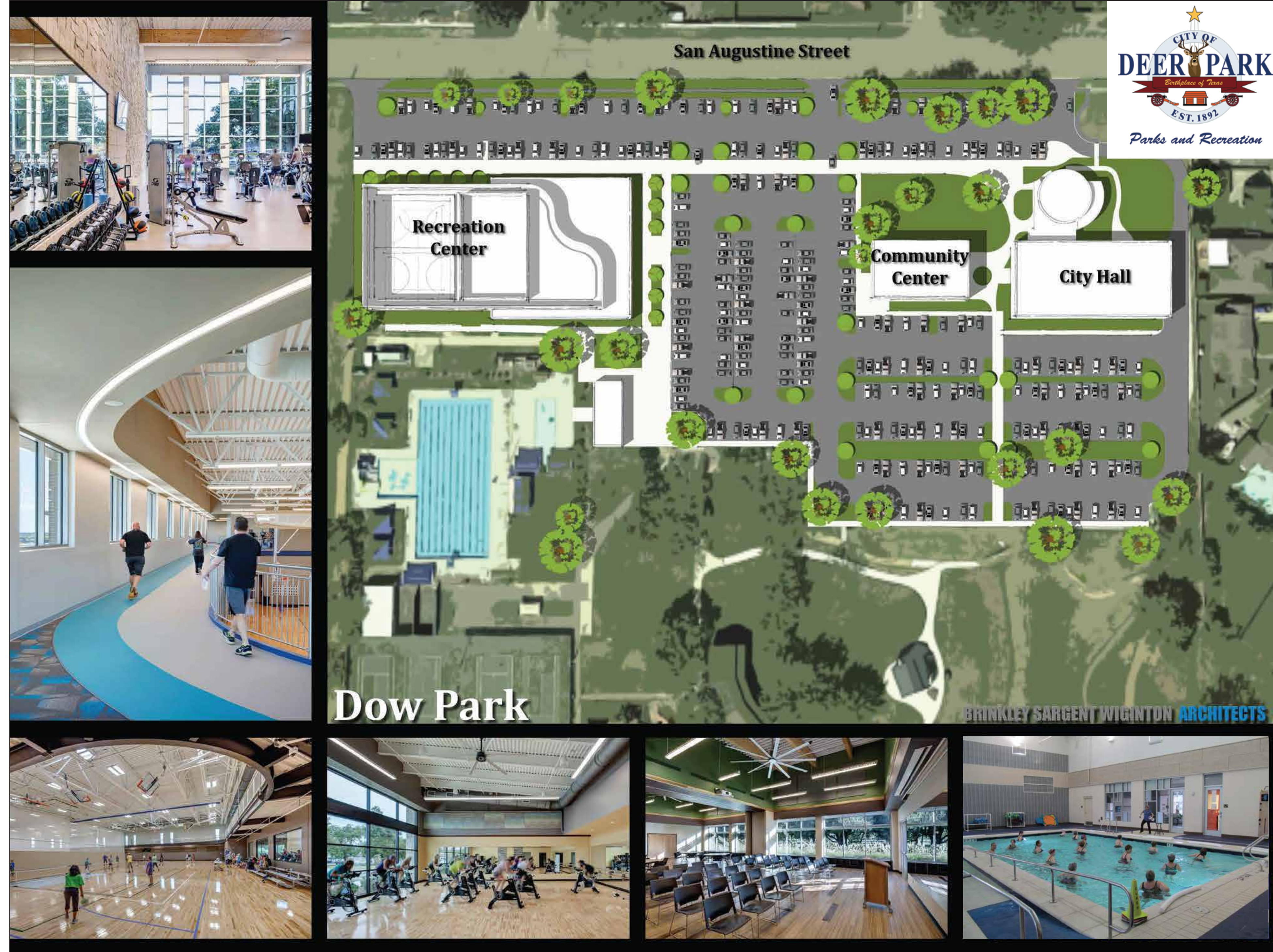
Schematic above developed by Brinkley Sargent Wiginton Architects.

Early voting to be held at City Hall (710 E. San Augustine) - Election Day voting to be held at Deer Park Community Center (610 E. San Augustine, Room 12)