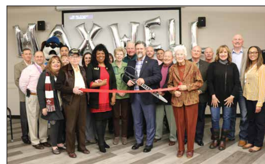
Ribbon cutting - January 2019 Expansion included changes to interior design and parking lot