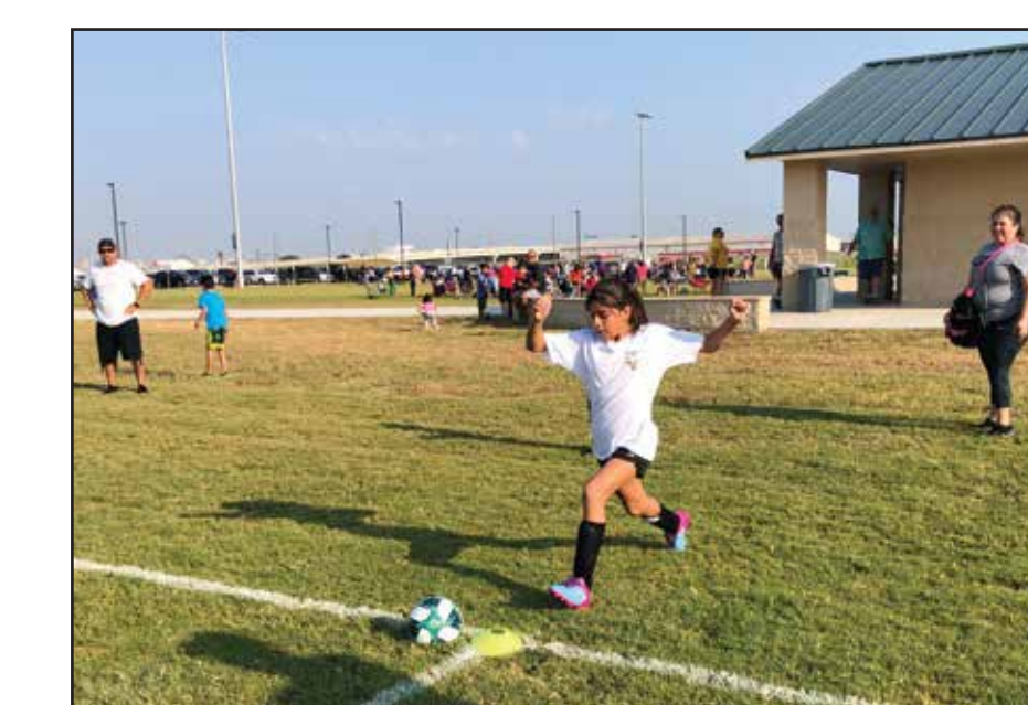
Ribbon cutting - Phase 1 August 2019 Six total fields - Four lighted fields Concession stand, meeting room and more