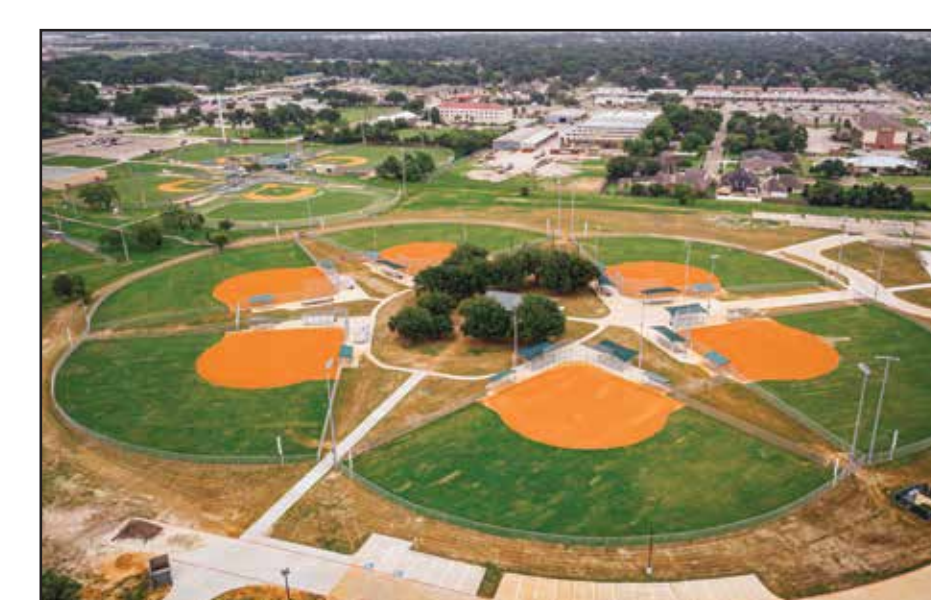
Ribbon cutting - Phase 1 June 2019 Four lighted ballfields, Two practice fields Batting cages, parking, concession stand, restroom/maintenance facilities