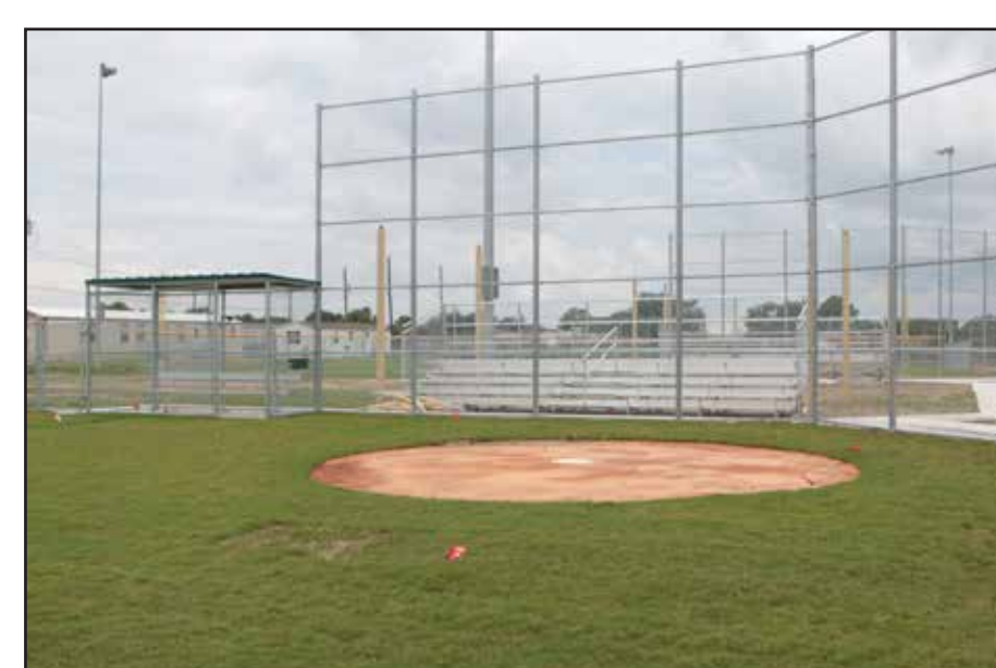
Ribbon cutting - August 2017 Features five renovated fields, eight new sets of bleachers, new concession stand