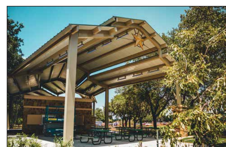
Ribbon cutting - September 2018 Features two new pavilion structures available for public use